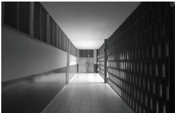
Figure 02 - corridor on a Severiano Mario Porto school, east facade

On the roof, all buildings have a robust eaves, with more than 2 meters, where this advance function as a horizontal element of shading. In schools, the corridors are used as structure and addition to sun protection (Figure 2).