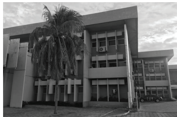
Figure 01 – preserved case study

The state of conservation of Severiano Mário Porto's buildings in Boa Vista was the main criterion for choosing case studies. The cases that interests this research are those in which the project intention was preserved or partially preserved. From the 4 case studies selected, 03 are schools, partially preserved, and 01 is an institutional building for public use (Figure 01), with a good state of preservation.