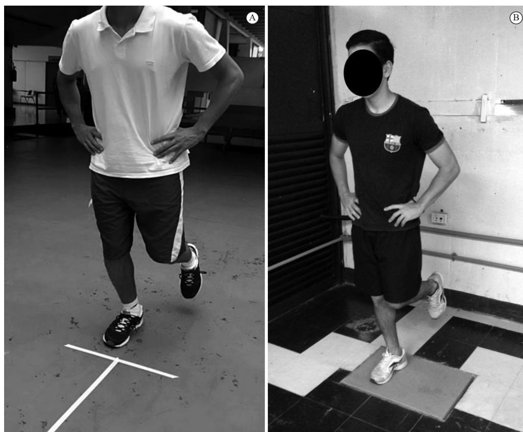
Figure 3. Illustration of the initial position of the hop test (A) and vertical jump test (B).

All measurements were taken from the dominant limb. The SHT started with the participants in single-leg standing behind a line marked on the floor with a knee slightly flexed for 10 seconds, until a verbal command was given (Figure 3). Immediately after the verbal command, they were asked to jump forward as quickly and as long as possible and to land with the same limb. In order to prevent influences of the upper limbs during the propulsion phase, subjects were instructed to maintain their hands on the waist. The jump was considered valid if the participants could maintain their balance for at least 5 seconds after landing. Subjects performed three SHTs with a 1-minute interval between tests, and the best attempt was used for analysis purposes.