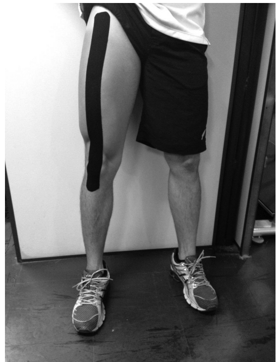
Figure 2. Illustration of the tape, after application.

After the calculation of the SB value and removal of the paper backing from the tape, the strip was applied with the subject lying on a bench with the leg positioned off, and the knee from the dominant limb flexed at 90° (Figure 2). The strip was stretched until it reached the DIS value, which according to the equation would produce a tension of approximately 40%. Tape was always administered by the same certified physical therapist (certified KT1/KT2).