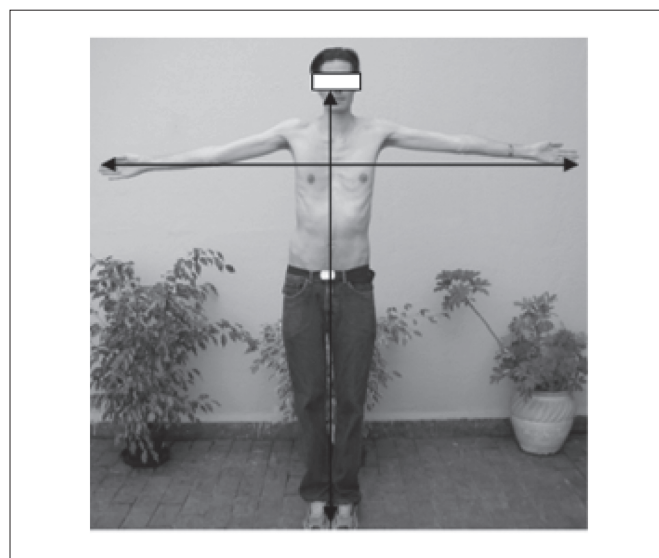
Figure 2. Male, 19 years old with dolichostenomelia.