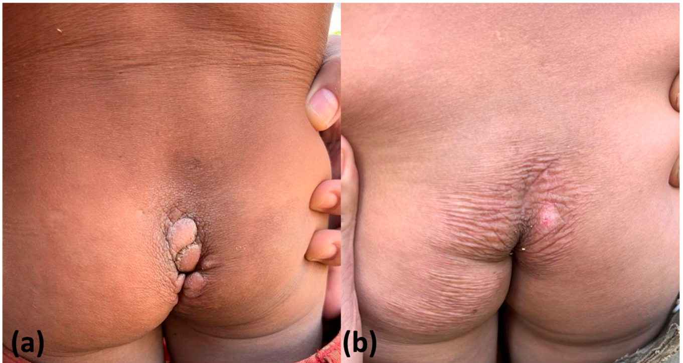
Figure 6. Details of coccygeal tungiasis (a) and (b) lesions at 3 months after application of NYDA ® . Hypertrophic scars remain indefinitely in some cases (a).