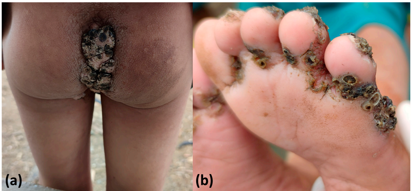
Figure 5. Details of coccygeal (a) and plantar (b) tungiasis lesions 7 days after application of NYDA ® . The lesions became dry with abundant crusts.

A reevaluation of the treated animals 7 days after afoxolaner administration and soil evaluation 7 days after fipronil application were not possible.