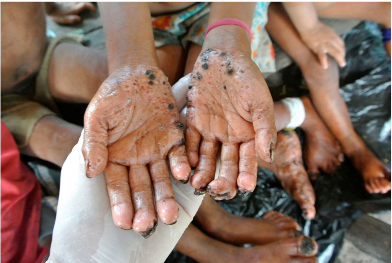
Figure 1. A case of tungiasis in a Sanumás community that resulted in permanent deformity of the distal interphalangeal joints of both hands.

The Yanomami territory is a 192,000 km 2 area located in northern Brazil and Venezuela. The Sanumás are a subgroup of the Yanomami linguistic family [7] and are divided into different communities that are settled along river courses and in places with plain terrain. The geographical characteristics of this region have been described elsewhere (Access point: (4°00'1" N 64°29'22" W; altitude = 759 m above sea level)) [6]. A recent survey showed that the point prevalence of tungiasis in this community was 8.11% in January 2022 (95% confidence interval = 6.04–10.78%) [6]. Additionally, the disease mainly affects children in the Sanumás communities and can result in severe secondary complications, including verrucous coccygeal lesions, secondary infection, and deformities (Figure 1) [6]. Moreover, T. penetrans is widely present in the in-house soil of residences, and this is the most important risk factor for the occurrence of tungiasis [6]. This population lives in conditions of low social development. Houses are made of straw or clay, sometimes without walls, and are built on compacted natural soil [6].