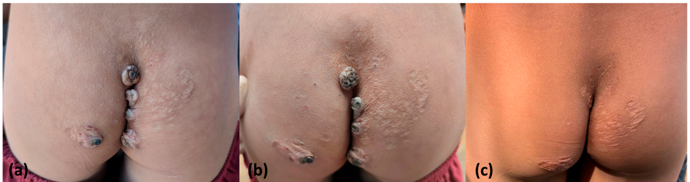
Figure 4. A case of coccygeal tungiasis before (a) and at 7 days (b) and 3 months after application of topical dimethicone NYDA ® (c). In the short-term evaluation (b), we observed that lesions presented dry crusts; in the long-term evaluation (c), all verrucous lesions had regressed in most cases.