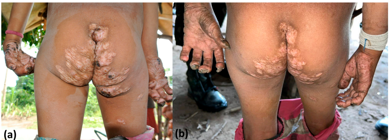
Figure 7. A case of severe tungiasis that resulted in permanent deformity of the distal interphalangeal joints of both hands before (a) and 3 months (b) after application of topical dimethicone NYDA ® .

In the first visit that occurred in January 2022, the internal soil of 60 of the 78 (75.64%) houses evaluated were infested according to the direct (median infestation level = 1) [6] and molecular evaluation (mean infestation level = 1757.46 T. penetrans gene copies/200 mg of soil). In the second visit that occurred in April 2022, the internal soil of only 22 of the 78 houses (28.21%) was infested according to the direct (median infestation level = 0) and molecular evaluation (mean infestation level = 37.72 T. penetrans gene copies/200 mg of soil). In the soil evaluation, in addition to Tunga penetrans , we found a massive infestation by Ctenocephalides felis that also infested domestic dogs, according to the veterinary evaluation. Although direct on-site examination is not capable of differentiating species, our molecular target was specific.