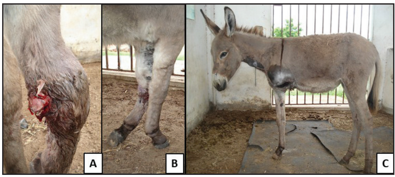
Figure 1. A- Female donkey presenting a medial wound revealing the necrotic aspect of the left radius (Salter-Harris type 1 fracture); B- Left forelimb with grade 5/5 lameness; C- Immediately after surgery, the donkey weight bearing well on three legs.

Postoperatively, the donkey was submitted to broad spectrum antibiotic association (benzathine penicillin³: 40,000 UI.kg⁻¹, intramuscularly [IM], q48h, 4 doses; and gentamicin⁴: 4 mg.kg⁻¹, intravenously [IV], once a day [s.i.d.], 7 days), and tetanus prophylaxis. Anti-inflammatory (flunixin meglumine⁵: 1.1 mg.kg⁻¹, IV, s.i.d., 3 days) and analgesic (ketamine⁶: 0.2 mg.kg⁻¹, IM, 3 times a day, 5 days) therapy was also performed. Preventative treatment for overload laminitis was initiated and included frog support pads and