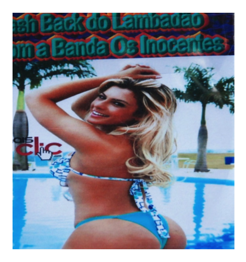
Figure 2. Cover of CD from the band Os Inocentes. We may note the watermark on the image that identifies the website where the photo was found.

In the early 1990s, the copies were not made on CDs. This technology only became accessible in the decade of 2000. Before then, lambadão circulated on cassette tapes. One musician recalled a pioneer use of the CD: