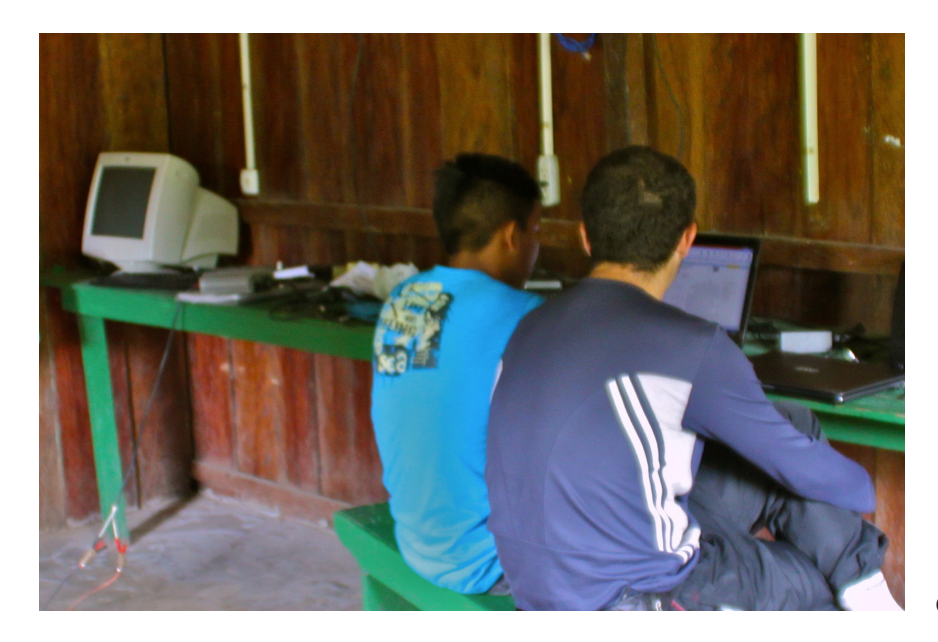
Gesac internet access point at Pamáali School