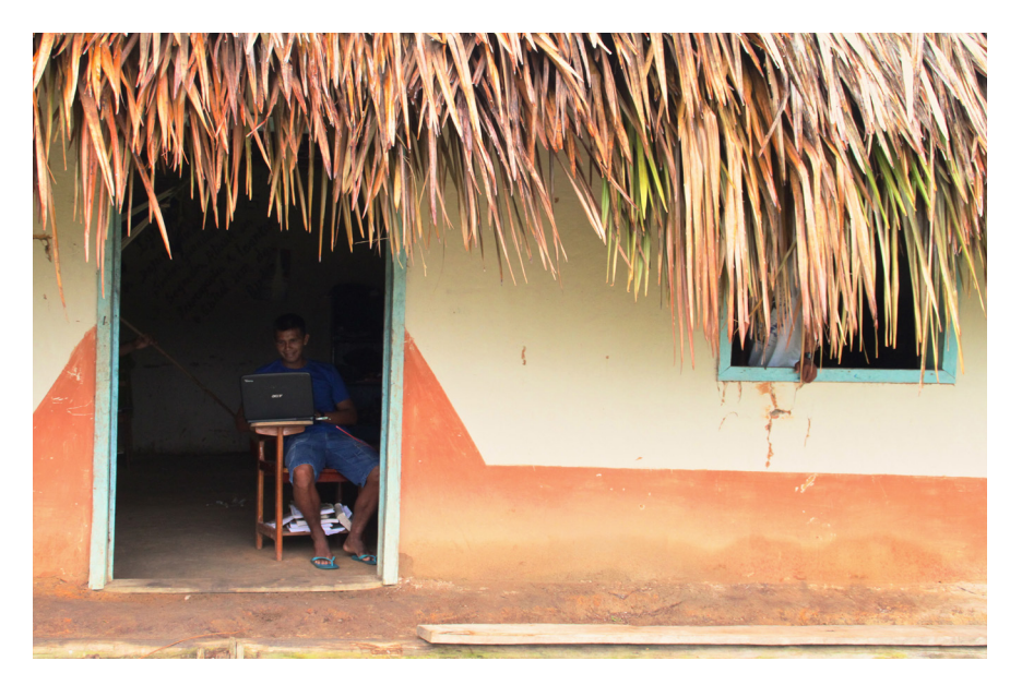
Teacher using a computer at Pamáali School