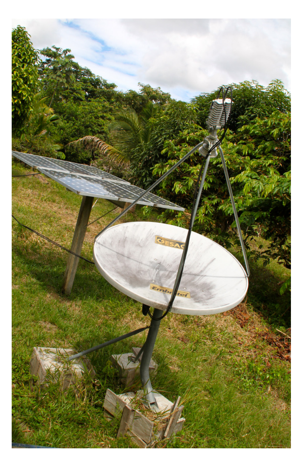
Gesac Antenna and solar panels at Pamáali School