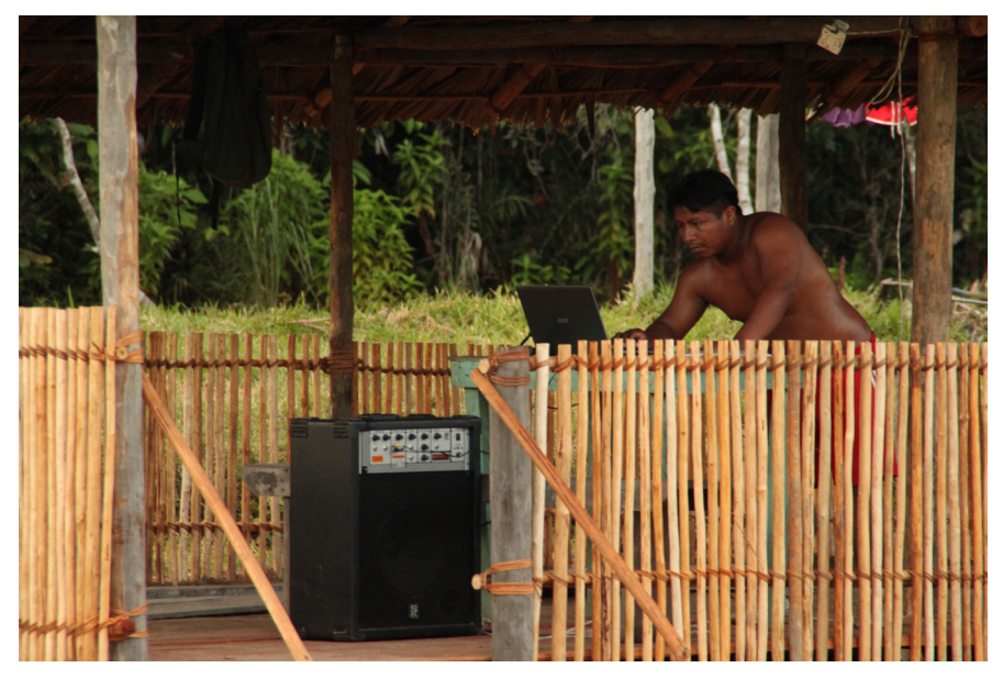
Teacher choosing a tune to be played during a soccer game at Pamáali School