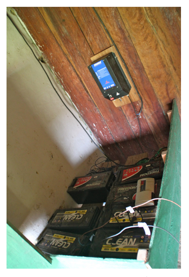
Batteries used to store solar energy at Pamáali School