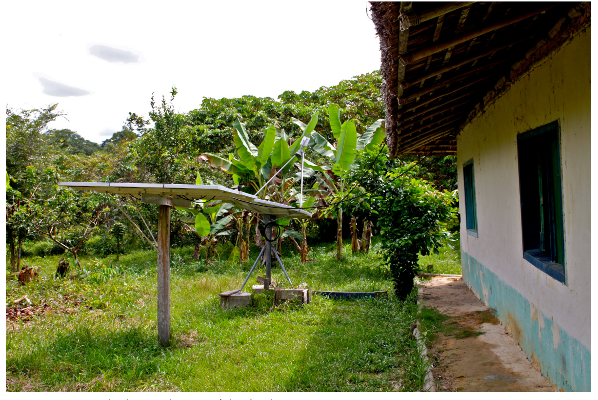
Gesac Antenna and solar panels at Pamáali School