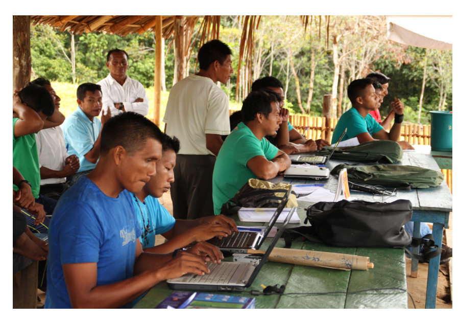
Teachers taking notes during an assembly at Pamáali School