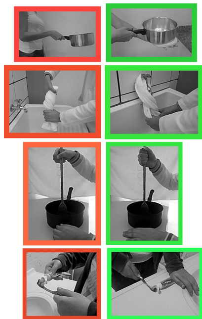
Fig. 1 – Examples of modifications in performing activities of daily living. The items on the left indicate movement patterns in which the position of the joints of the wrist and fingers enhance mechanical forces toward deformities commonly observed among patients with RA. The illustrations on the right suggest modifications that favor the use of other, more stable, joints, or the distribution of the load among multiple joints, avoiding painful and potentially harmful positions.

one third of patients will abandon the work during the first three years of the disease. 52