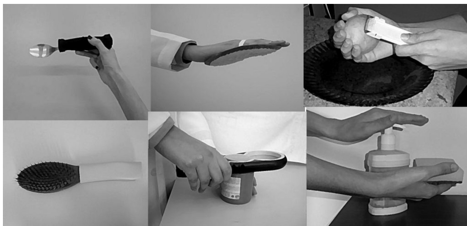
Fig. 2 – Adapted utensils. The proposed adjustments are based on the principles of joint protection and energy conservation, with distribution of mechanical loads and promoting the use of larger joints during activities.