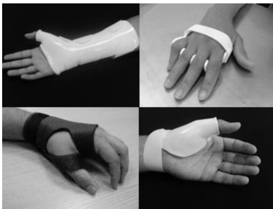
Fig. 3 – Examples of orthoses for upper limbs, suggested for patients with RA.

promote improvement in pain and morning stiffness for the patient. 68,69