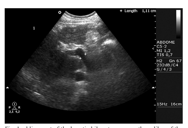
Fig. 1: oblique cut of the hepatic hilum to measure the caliber of the portal vein.

Standardization of test analysis - The tests were performed in random order and by two independent examiners, blinded to the patients' disease. The two examiners had at least three years of experience in abdominal ultrasound (obs1 and obs2), previously trained in the test's analytical method. A new test was performed by a radiologist with eight years of experience (obs3), with prior knowledge of the patients' disease. Maximum time between tests was 60 min.