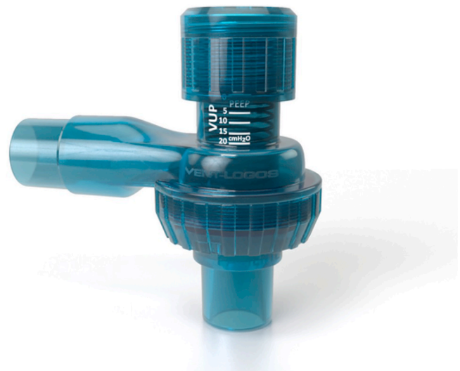
Fig. 2. VUP valve used in EMT program.

The initial expiratory pressure will be 8 cmH 2 O and can be changed at each visit depending on participants' tolerance, whether it is easy or difficult to exhale assessed by research coordinators. The participants will be encouraged to blow out as slowly that they can. Both protocols will be performed for 24 weeks, and outcome measurements will be performed every 8 weeks.