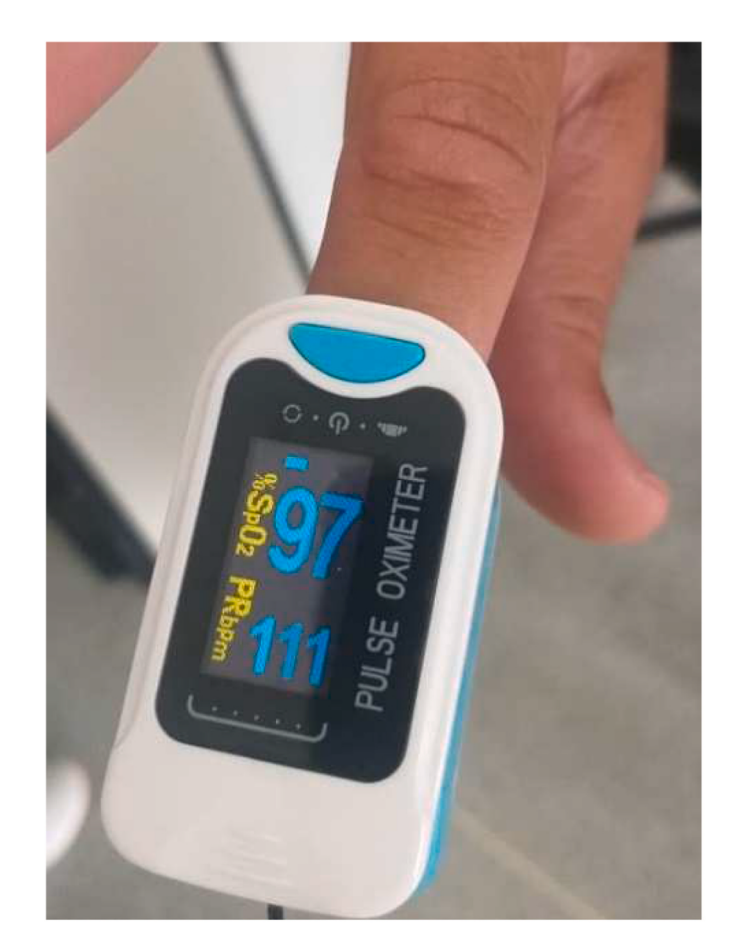
Fig. 1. Representative images of patient number 11, a diabetic, obese male patient, at first contact exhibited an oxygen saturation of 97% and was feeling well.

cases, oral prednisolone was prescribed at a loading dose of 1 mg/kg body weight for one day and 0.5 mg/kg body weight for an additional 4–5 days. A total of 68 patients were prescribed corticosteroids at home during the initial inflammatory phase of the disease, and four critically ill patients were prescribed corticosteroids at the hospital by assistant doctor (Table 3).