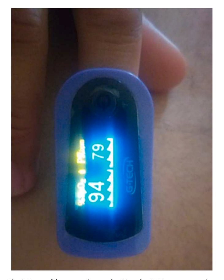
Fig. 2. Image of the same patient number 11 on day 9. His oxygen saturation level decreased to 94%. He was alerted to undergo treatment after confirmation of drop in oxygen saturation level.