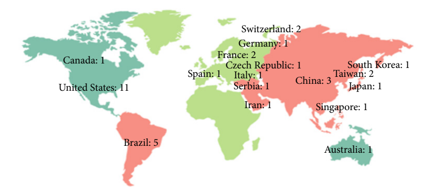
Figure 2. Geographical distribution of studies included in the review on factors associated with adherence to immunosuppressive medication in kidney transplant patients.

Data available in Repositório Institucional da UnB describe the methods of measuring adherence, the observed adherence outcomes, and the associated factors identified. Adherence was measured in most studies by validated and widely used instruments, such as the Baasis and the ITAS. Other scales used for other diseases have also been adopted, such as the Morisky instrument, used in various versions of 4 or 8 questions. The adhesion values were quite distinct ranging from very low values like 10.8 and 16.9%, to very high values like 90.8 and 94.5%. The tests used to gauge the associations involved both univariate and multivariate tests.