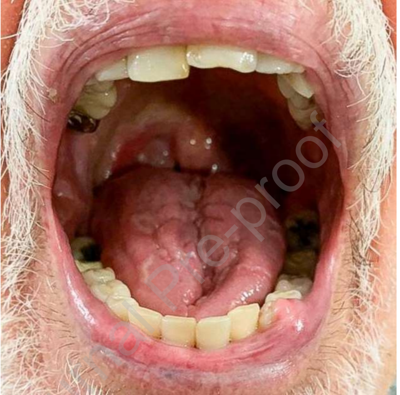
Figure 1C – May 25 th , 2020. Patient recovered from COVID-19 showing atrophic areas surrounded by elevated yellow-white halo classified as moderate geographic tongue according to the severity index scoring system (Picciani et al., 2019). We also can observe a slightly erythematous area in the right palatine tonsil region, however, the patient reported being asymptomatic.