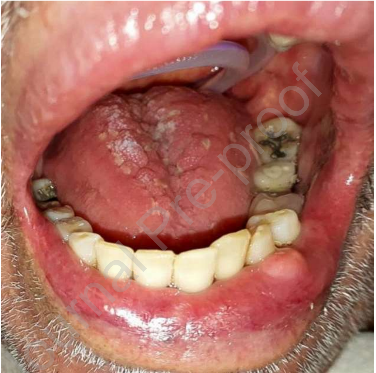
Figure 1A – April 24 th , 2020. COVID-19 patient presenting a white plaque on the tongue dorsum, centrally located, associated with several small, circle-shaped yellowish ulcers resembling the late stage of herpetic recurrent oral lesions associated with candidiasis. Also,