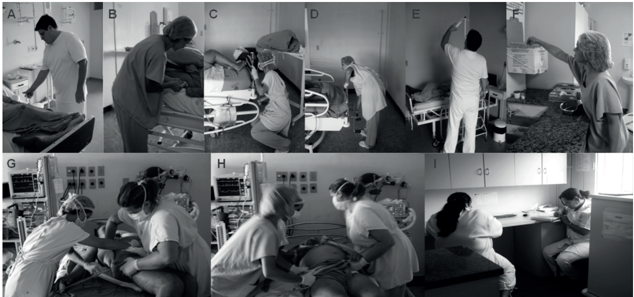
Figure 2 - Postures evaluated by the REBA protocol

Note: (A) Administration of medications - standing (MC); (B) Administration of medications -bending (ICU); (C) Handling bed cranks – position 1 (ICU); (D) Handling bed cranks – position 2 (ICU); (E) Placing the serum in the IV pole (MC); (F) Disposal of material (ICU); (G) Bed bath (ICU); (H) Placing the patient in bed (ICU); (I) Follow-up of the patients (SC).