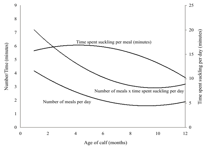
Figure 2 - Number of meals per day, length of meal and timer per day spent suckling depending on the age of Curraleiro Pé Duro calves.