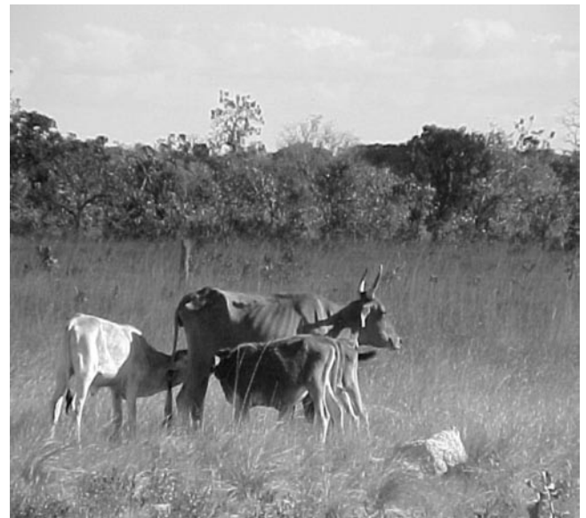
Figure 1 - Allo-suckling: Curraleira cow suckling her own calf, an orphan calf and a calf from the general herd.

A total of 571 cases of attempted suckling were observed, of which 87.1% (497) were successful. In 12.9% (74) of the cases suckling was attempted but not successful. Calf sex was not a significant factor ( X^2 = 0.57 ; P > 0.45 ) in determining the success of suckling (Table 1). The position of the calf relative to the cow significantly affected ( X^2 = 129.67 ; P < 0.0001 ) the success of suckling. When the calf nursed from the normal (lateral) position, suckling was successful 99.5% of the time. Attempts to suckle from behind were described in 136 cases, with 92 (67.6%) being successful. It is thought that as the calf trying to suckle from behind is out of sight, the dam does