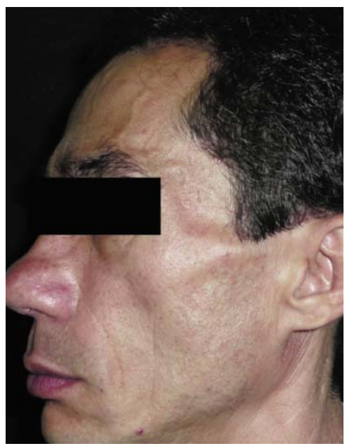
FIGURE 5: Visualization of the temporal vessels and the bone framework of the face: evident orbit and zygomatic arch due to loss of facial subcutaneous Depression on the buccal area due to loss of Bichat