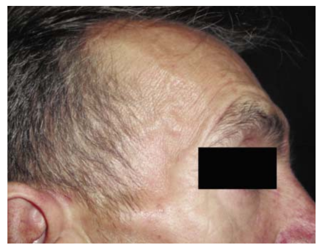
FIGURE 3: Visualization of the temporal vessels and the bone framework of the face due to loss of subcutaneous fat

The FLI evaluates three facial regions (Figure 7). The malar region corresponds to the zygomatic