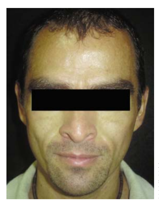
FIGURE 8: Patient with mild or grade I FL, with FLI=4,8