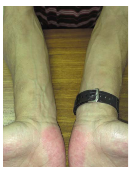
FIGURE 2: Important thinning of the upper limbs due to loss of subcutaneous fat, with evidence of the subcutaneous yessels

analysis they identified the resitine gene as being implicated on the susceptibility to HIV associated lipodystrophy. 41