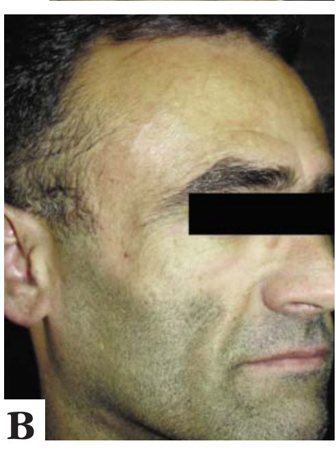
FIGURE 7: A - Patient with temporal, pre-auricular and malar lipoatrophy; B - Same patient in oblique position