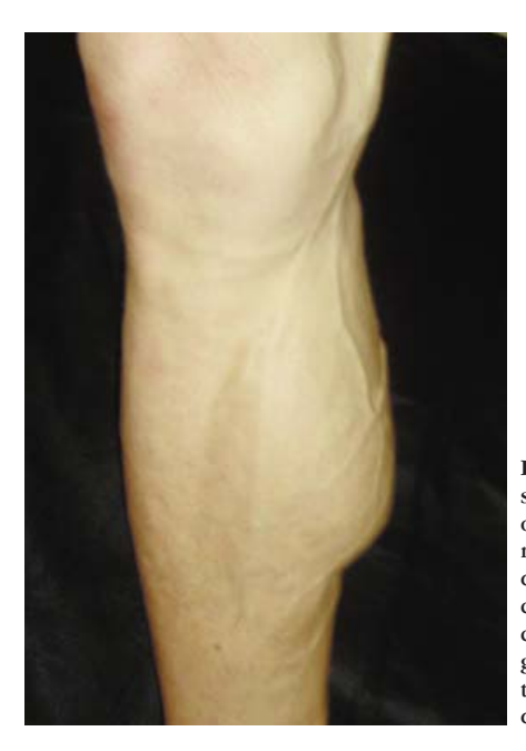
FIGURE 1: Right leg showing atrophy of the subcutaneous fat with evidence of the musculature and subcutaneous vessels, giving the patient the aspect of pseudo-athlete