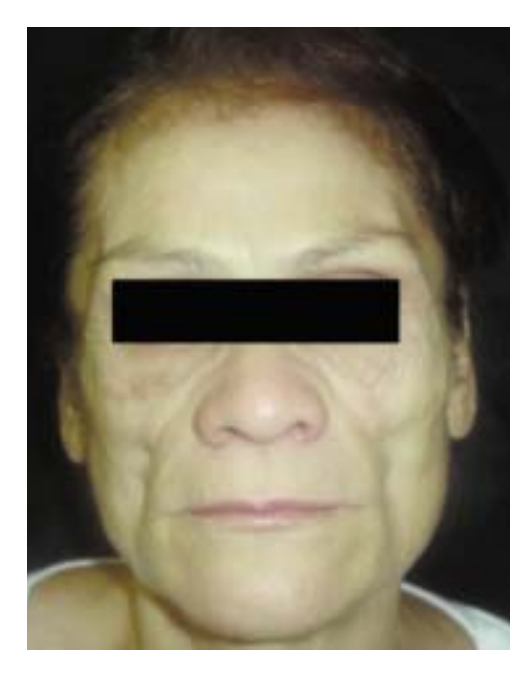
FIGURE 11: Patient with grade IV facial lipoatrophy (FLI=18,2)

Leptin is an amino acid product from the human leptin gene. It regulates the energetic, neuroendocrine and functional homeostasis of the organism. The recombinant human leptin is an emerging therapeutical possibility for the lipoatrophy caused by its genetic deficiency, and it might have some indication for the HIV/AIDS associated lipoatrophy. <sup>56</sup>