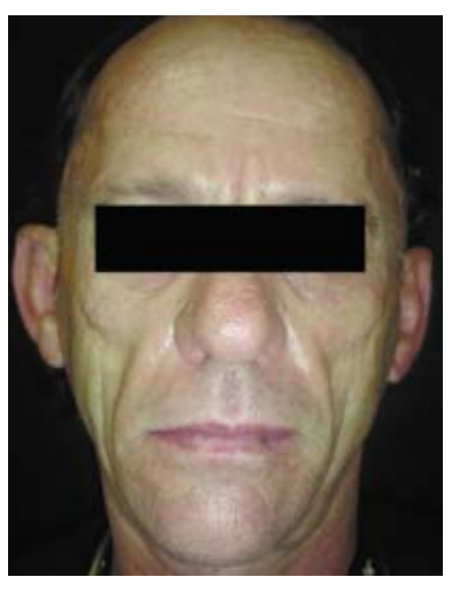
FIGURE 6: Important atrophy of the facial subcutaneous fat, giving the patient's face an ageing aspect

angle and the lower border of the mandible. 17