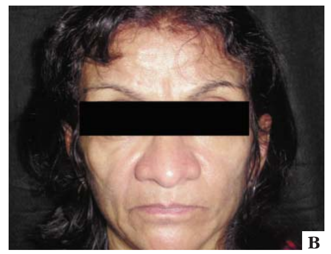
FIGURE 12: A - Patient with very severe FL (FLI=19,2), before PMMA; B - Same patient after 37,2 ml implant of PMMA

Carey and collaborators performed a randomised, multicentric study, with follow-up periods of 24 and 96 weeks, comparing adult patients with facial lipoatrophy induced by antiretrovirals that received injections of polylactic acid into the deep dermis with a control group. These authors showed that the treatment of facial lipoatrophy with polylactic acid in adult patients infected by the HIV promoted only a modest augmentation of the facial thickness but not of the facial volume. In contrast, the patients perception of the increment on well being, quality of life and cosmetic benefits was significant. The polylactic acid does not interfere with the fat loss in other areas of the body. The authors also emphasize that additional comparative studies are necessary in order to define the optimum treatment for HIV facial lipoatrophy. 81