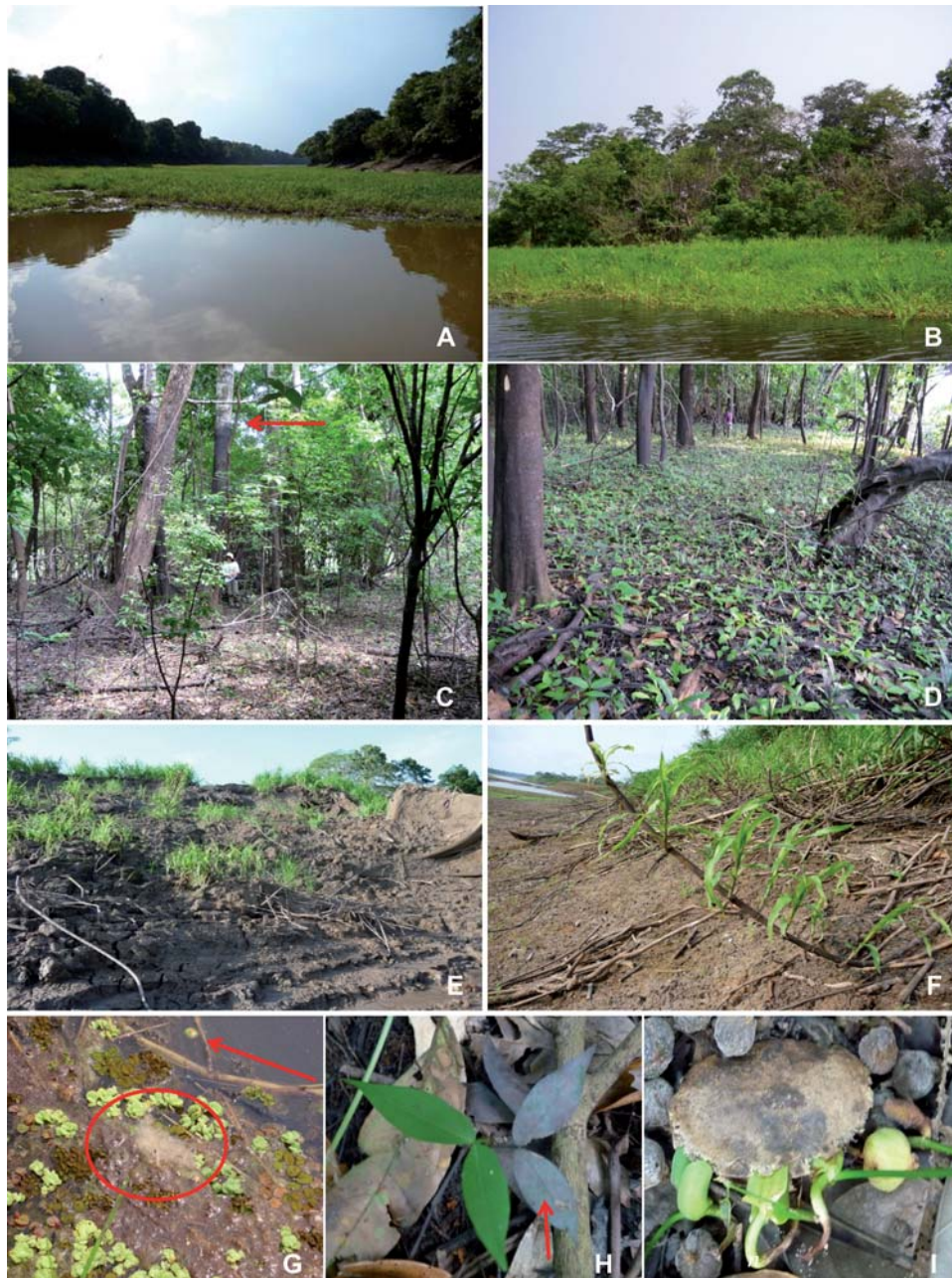
Fig. 1 Features of the várzea floodplain vegetation. (A) Várzea lakes colonized by macrophytes; (B) floating grasses on the edge of the flooded forest; and (C) interior of the forest during the terrestrial phase (the arrow points to a mark left in the tree that indicates the water level reached in the last flood); (D) extensive seedling bank in the interior of a várzea forest, about a month after water retreat; (E) colonization by seed-germinated plants of Paspalum fasciculatum ; (F) colonization by vegetative regrowth of P. fasciculatum ; (G) seeds of Pseudobombax munguba (circle) and other fruits (arrow) floating in water; (H) Clusiaceae seedling with new recently produced leaves and old leaves (arrow) which have survived the last flood (still covered with sediment); (I) seed germination in water of an unidentified legume.

factors and determine the position of the closed-forest border, which is generally located where the height of the water column reaches between 7.5 and 8 m or 228 days of flooding per year on average. Monospecific