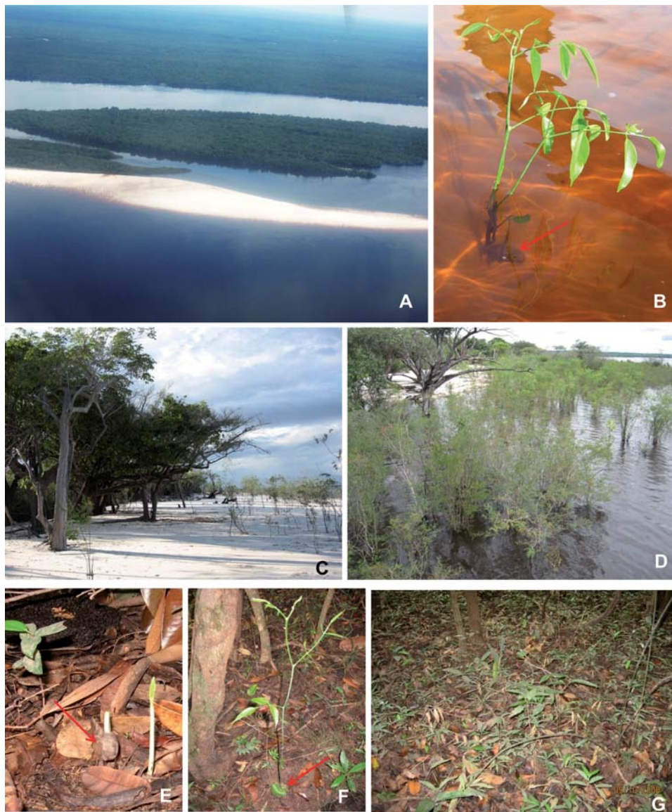
Fig. 2 Features of the igapó floodplain vegetation. (A) Aerial view of the igapó forest; (B) water-germinated seedling at the end of the flood period; (C) igapó lakes showing the absence of colonization by macrophytes; (D) colonization of the igapó shores by pioneer woody perennials during the period of water retreat; (E and F) seedlings that germinated in the igapó forest following the water retreat; (G) seedling bank of Astrocaryum jauari which have survived the last flood. The arrows in (B), (E) and (F) are pointing to seeds that contain large cotyledonary reserves.

border and dominate the river banks. They are followed along the flood-level gradient by typical early secondary tree species, such as the genus Cecropia which can reach ages of 10–30 years. Subsequently, late secondary species Crataeva benthamii (Capparaceae) and Pseudobombax munguba (Bombacaceae) can be found, which can be 20–100 years old. These are followed by well-developed low-várzea forests, where there are species with ages up to 400 years, such as Piranhea trifoliata