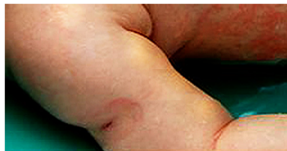
Figure 1 Erythema and induration at the site of previous vaccination with BCG.

Typical clinical characteristics of KD only appeared in this infant on the 14 th day of illness with the relapse of the maculopapular rash in association with bilateral non-purulent conjunctivitis; dry, reddish and fissured lips; tongue with reddish and hypertrophic papillae; and erythema and edema of the palms and soles that quickly evolved into a deficit of perfusion, with progressive ischemia of the distal third of the feet. Despite the reintroduction of intravenous wide-spectrum antibiotics (cefepime and vancomycin) and the administration of dopamine, a progressive cyanosis of the toes was observed, followed by hypothermia and blackening of both halluces. Anticoagulant therapy was started with enoxaparin. Inflammation was observed at the site of the BCG vaccination scar (Figure 1) in association with a marked hyperemia of the anal region. An arterial Doppler ultrasound of the lower limbs disclosed an absence of blood flow in the distal tibiofibular branches, and alprostadil IV was started soon after. A computed angiogram showed significant dilatation of both iliac arteries (Figure 2), foci of rounded opacities in both lungs suggestive of pulmonary thrombosis, and a hypodense area in the splenic parenchyma suggestive of