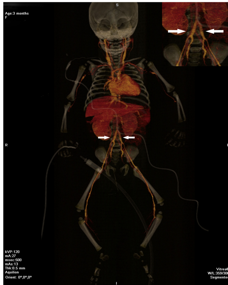
Figure 2 Whole-body angio-tomography showing the aorta with a normal diameter and significant dilatation of both iliac arteries (see detail in the upper right side of the image).

artery (6 mm) and pericardial effusion. Methylprednisolone IV at a dosage of 30 mg/kg/day was reinitiated and maintained for three days, followed by prednisolone at 2 mg/kg/day to reduce the inflammatory activity.