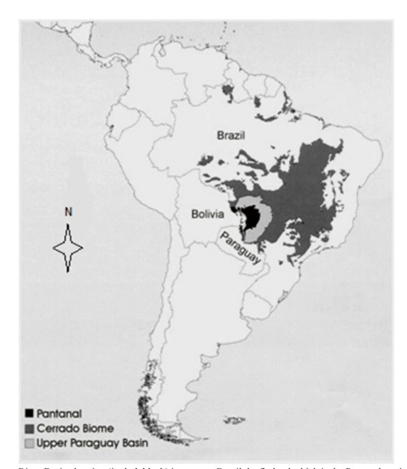
Figure 1. The Upper Paraguay River Basin showing (in dark black) in western Brazil the flatland which is the Pantanal, mainly in Brazil, but touching Bolivia to west and Paraguay to south, with influence of the Cerrado biome of central Brazilian territory. Figura 1. Bacia do Alto Paraguai (em preto) na porção rebaixada do oeste do Brasil, que é o Pantanal, principalmente no Brasil, mas tocando a Bolívia na porção oeste e o Paraguai na porção sul, com influência do bioma Cerrado do Brasil Central.

The Pantanal is a sedimentary basin, a mosaic of alluvial fans of Pleistocene origin. The geological characteristics include elevations named Xingu Complex and Rio Apa Complex, representing the Brazilian Crystalline Complex, whose substrate reflects the different geological events. The plains are sediments deposited during the Quaternary, which are markedly sandy, with restricted areas of clay and organic deposits. The relief of the whole Upper Paraguay River Basin has been recognized in three units: (1) the flood plain which is the Pantanal, (2) the adjacent residual elevations plus the depressions and (3) the highlands.